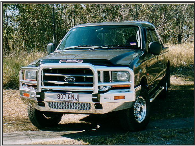
Polished Alloy Bullbar to suit Ford F250 / F350 2001 - 2006

Phone 07 3349 5422 for details and price or email sales@qldbullbars.com.au