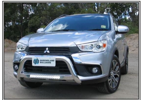
Polished Alloy Nudge to suit Mitsubishi 17MY ASX + Light Bar suits 10/16 -08/17